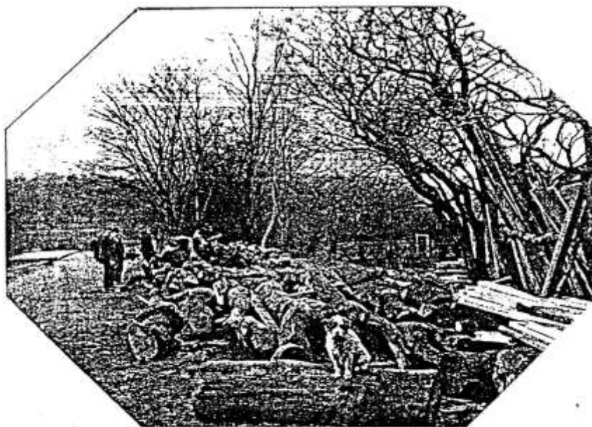
Wyndley Pool Dam, c. 1900. The timber reminds us that there was a saw-mill nearby. Land to the right of the picture is now occupied by a running track, one of the numerous facilities of the Wyndley Leisure Centre.