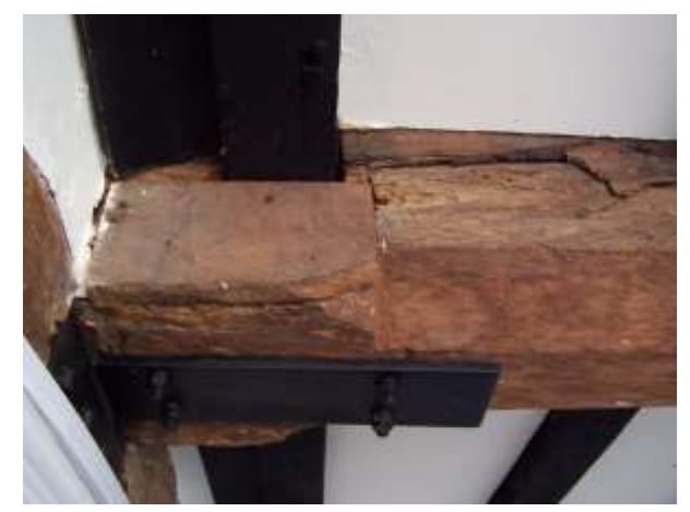
chamfered, but in places decay had weakened them,