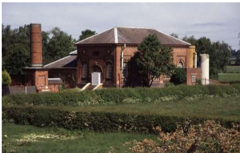
Shenstone Pumping Station

A year after the 1891 census was completed; the construction of Shenstone Pumping Station gave Sutton Coldfield its first tapped water supply.