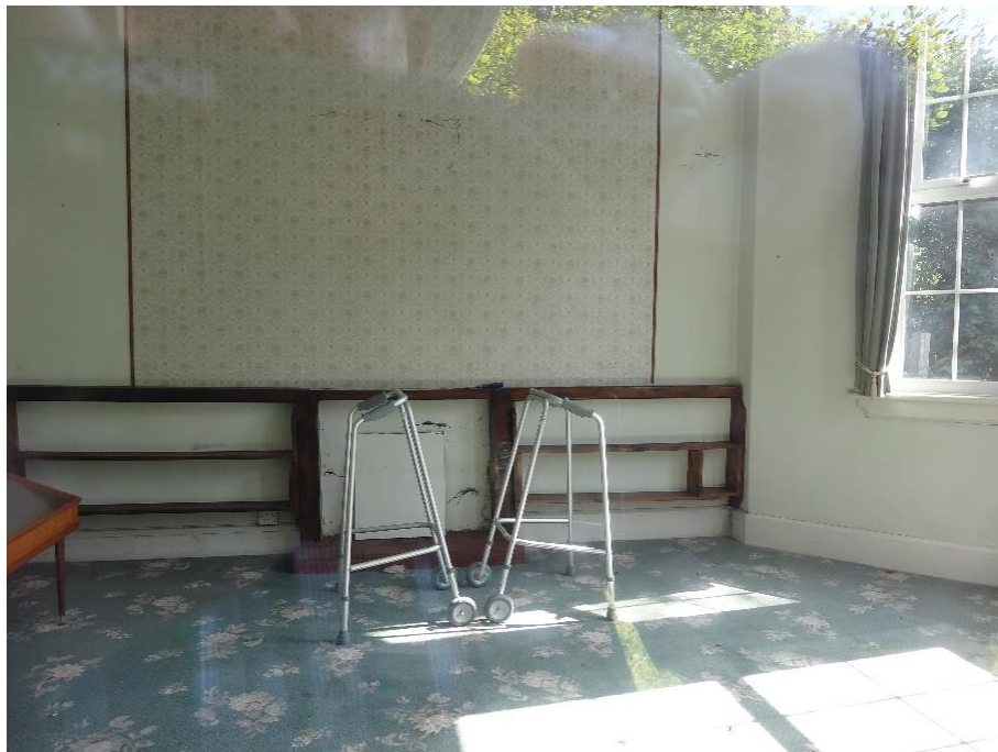
Fig. 21 – The same room in September 2014 photographed through the side window