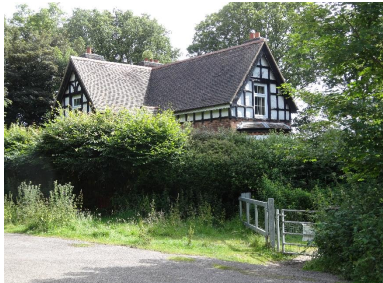
Fig. 7 – The south-western aspect of Midland Lodge with Midland Gate to the right of the picture with the bridge parapet nearest the camera.

When one first encounters the lodge on the roadway leading from Meadow Platt to the Hartopp Gate one is taken aback by its sudden emergence in such sylvan surroundings and one's eye is pleasantly surprised by the attractiveness of its large gable ends and black mock timber patterns set off by three elegant tall chimneys. It is certain that in 1880 there were not as many trees in the vicinity as there are today. The photograph of Midland Lodge (Fig.1a) taken around 1910 depicts a more open location than is the case today when there are far more trees, many of which are quite mature.