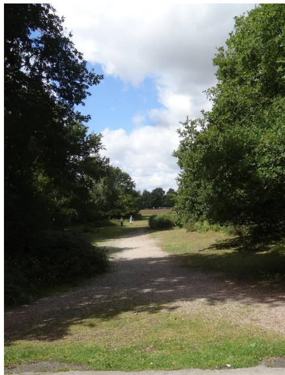
Fig. 5 – The cart road cut in 1880 from the railway bridge through the gorse of New Field to the Gravel Pit (seen in the distance) by Blackroot Pool. This provided a direct route to and from Midland Road.