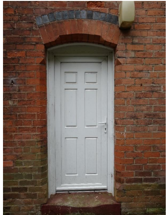
Fig. 15 – The north side-door illustrating the segmental arch with equal voussoirs, surmounted by a string of blue brick headers and chamfered surrounds.