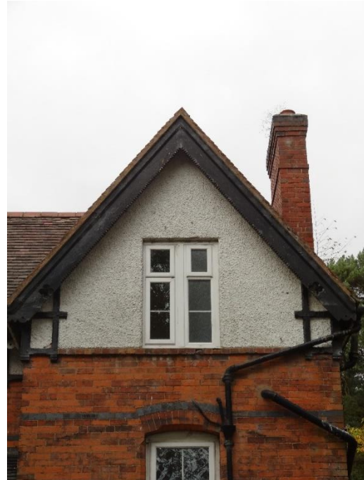
Fig. 9 – By contrast the bargeboards on the east-facing gable at the rear of the cottage have saw-tooth decoration on the lower edges and a single four-leaf clover cut-out at each lower end.