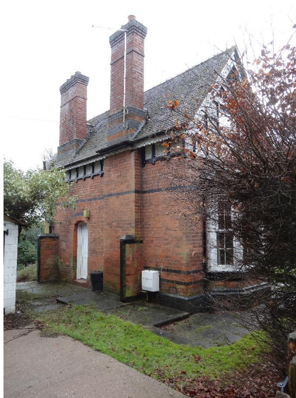
Fig. 19 – These gate portals on the northern wall would have provided a sizeable side entrance to the property and garden.