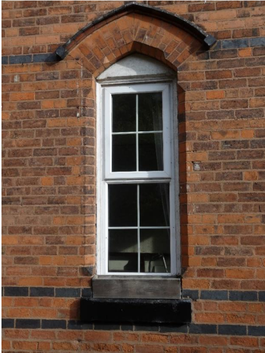
Fig. 14 – Side window of the south-facing reception room with Gothic Revival arched head. Note the decorative strings of blue bricks at the top and bottom of the window space.