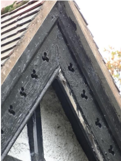
Fig. 8 – The bargeboards on the south-facing gable end showing clearly the clover leaf cut-outs in the bargeboards. The gable over the west front is similarly decorated.

The chimney pots shown on the 1910 photograph are yellow terra-cotta Crown Kings but likewise these have been replaced with plain round red terra-cotta pots. Now, the timber-framed patterns are painted black with white stucco infill panels but originally the timber would probably have been painted green or brown with the stucco left in its natural condition. The present-day arrangement would appear to present a more dramatic effect.