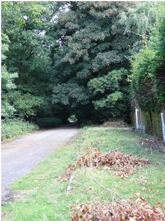
Fig. 4 – The carriage road constructed in 1880 from Midland Gate to the wall of the Four Oaks Estate (Hartopp Gate). The road passes in front of Midland Lodge, seen on the right of picture.