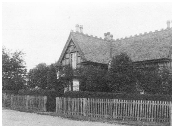
Fig. 1(a) – Midland Lodge in c. 1910