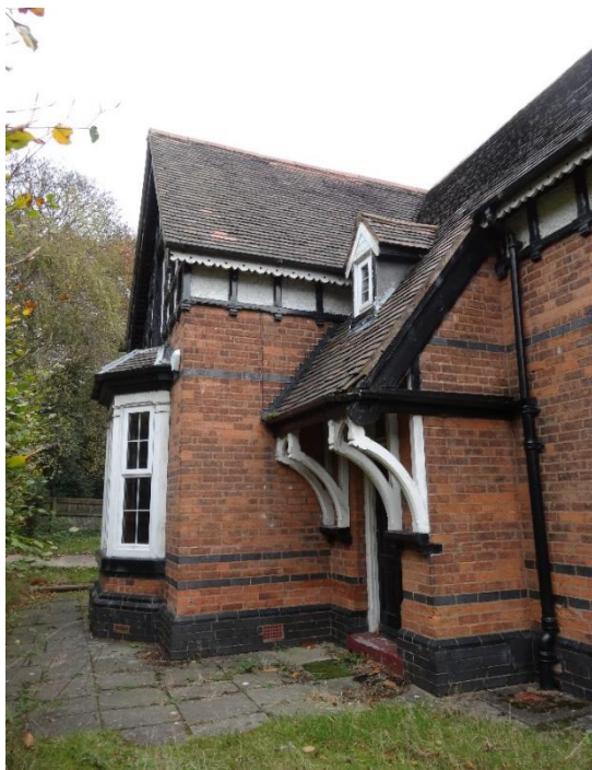
Fig. 12 – The front of Midland Lodge showing the blue-brick stepped base, the framed porch and the bay of the west facing reception room.

The original window frames have in recent years been replaced with double-glazed units using white UVPC fittings. Assuming that the contractors matched their replacements as closely as possible with the original window design, it seems likely that the major ground floor windows were originally of the sash type and multi-paned, whereas the upper were originally casement type. All of the ground floor windows have Victorian stone lintels. Sir Benjamin Stone's 1910 photo shows the bedroom windows to have been of the casement type with a pair to a window frame. The original glazing was two by three panels on each casement. The ground floor bay windows look to have been of the sash type with four over four window panes at the side and six over six for the west facing bay. However, as previously mentioned, the south facing bay originally had a large glazed door to enable access to the garden area.