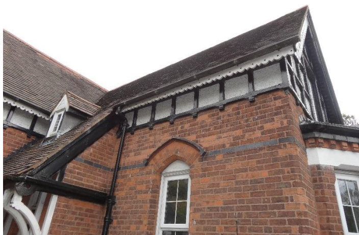
Fig. 10 – These decorated fascia panels with their alternating pattern of triangles and rounds plus piercings flank all of the gables at the front and rear of the house.