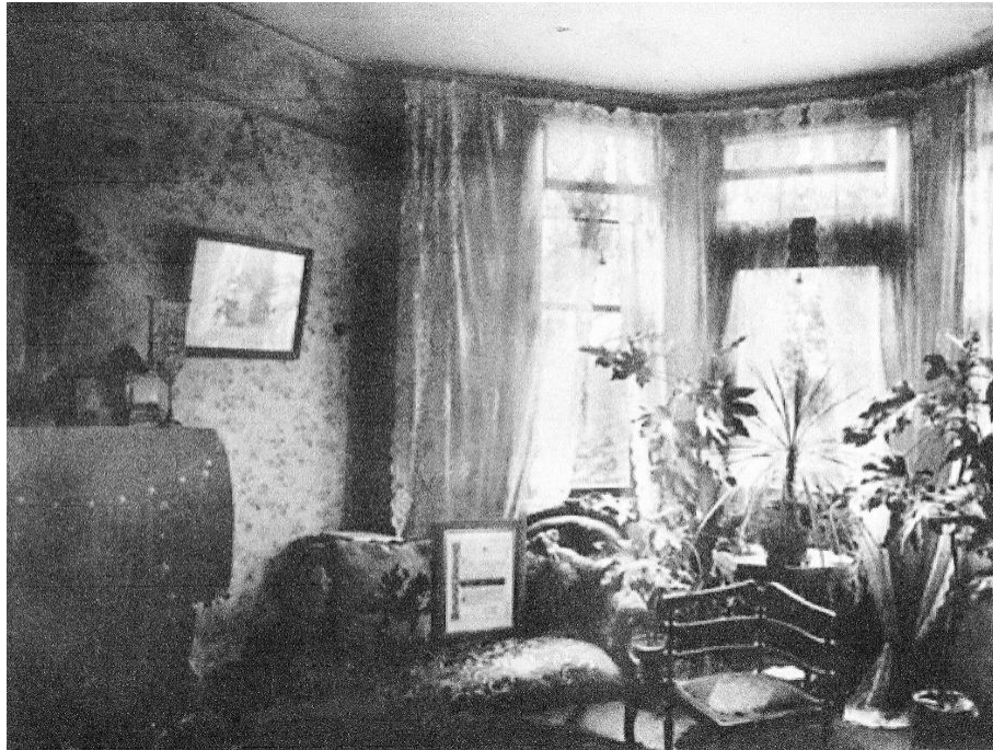
Fig. 20 – The interior of the south-facing reception room in c.1910. The original doorway to the garden can be seen.

The south-facing reception room is the most important room in Midland Lodge from a historic context. Fig. 19 shows a photograph taken by Benjamin Stone in c.1910 of the interior of this room. By way of comparison, Fig. 20, taken by the author in September, 2014, of the same room through the side window illustrates the sunny aspect of this room.