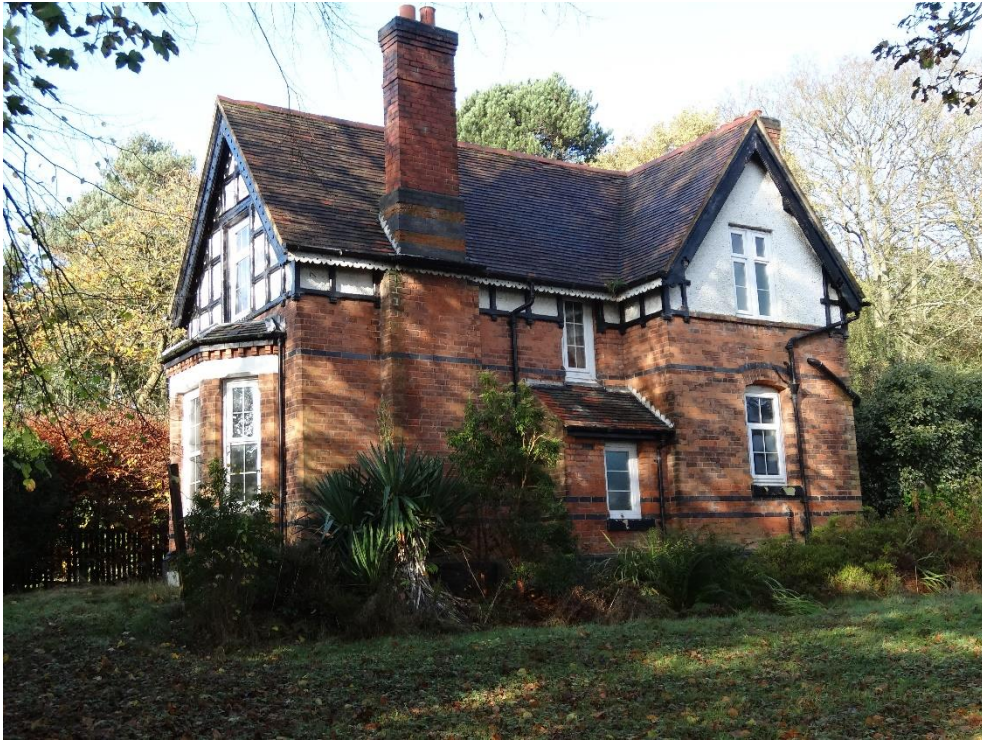
Fig. 18 - The south-eastern aspect of Midland Lodge taken from the bottom of the garden. Note that the garden slopes downwards from north to south as well as from west to east.