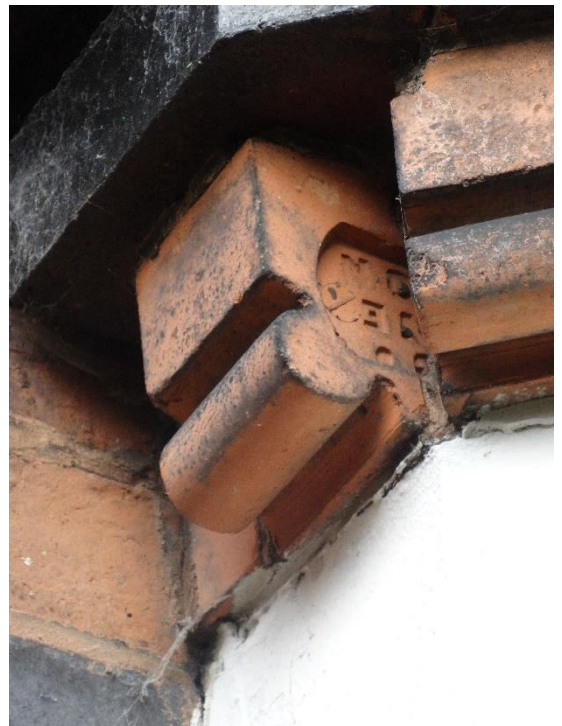
Fig. 17 – Close-up of one of the terracotta dentils showing the brick-makers mark within the frog of the brick. These were only used over the bay of the south-facing reception room.