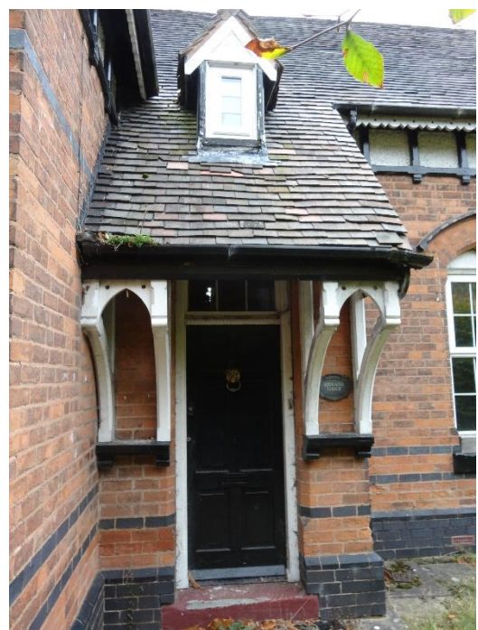
Fig. 13 – The front entrance showing the substantial fretted canopy supports and the gabled landing window over the front door.