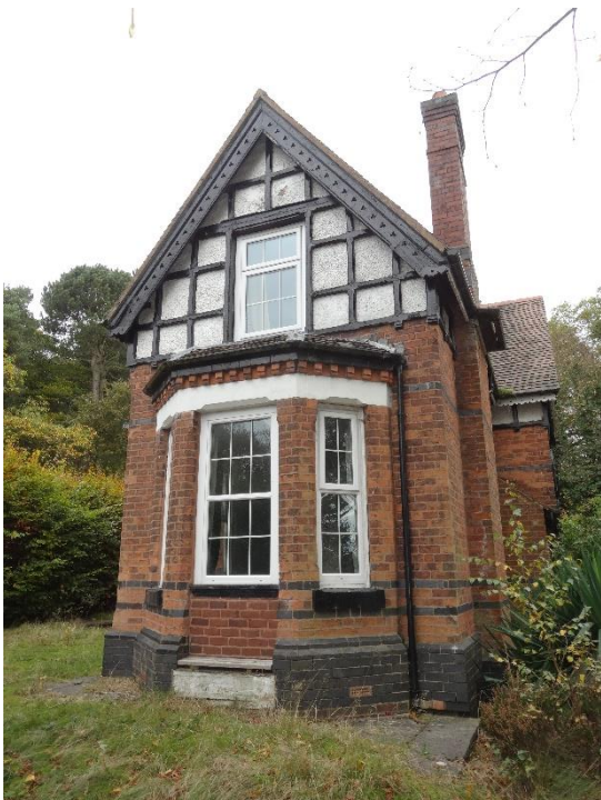
Fig. 16 – The south facing aspect of the cottage. Note the bricked-in doorway of the bay window that originally led into the garden, and the terracotta dentil dressings above the lintels.