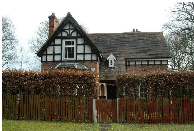
Fig. 1(b) – Midland Lodge in February, 2014