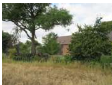
10. Fox Hollies Farm