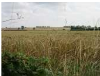
4. Fields around Forge Farm