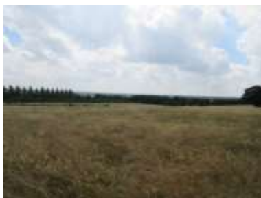
13. View East of Fox Hollies