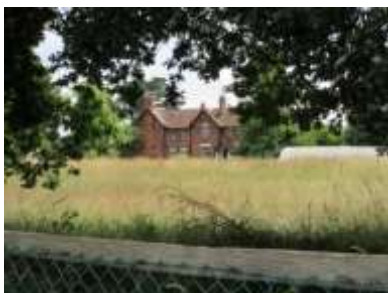
14. Langley Gorse, Fox Hollies Rd