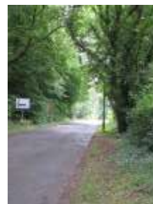
15. End of Walk: Corner of Fox Hollies Road and Signal Hayes Road . Return to Car Park at B&M