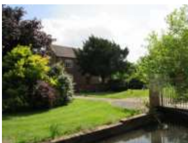
8. Peddimore Hall and Outer Moat