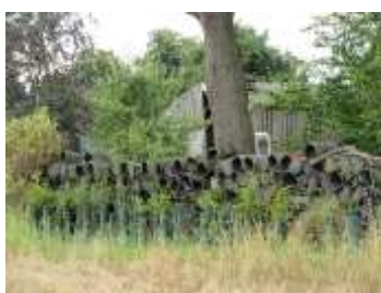
11. The Crucibles wall.