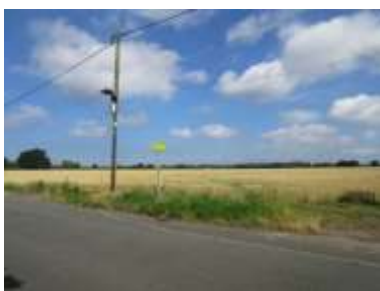
1. Start of Walk from Car Park at B&M Store, Minworth