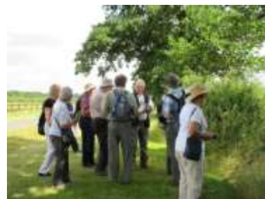
6. Group Members near Peddimore