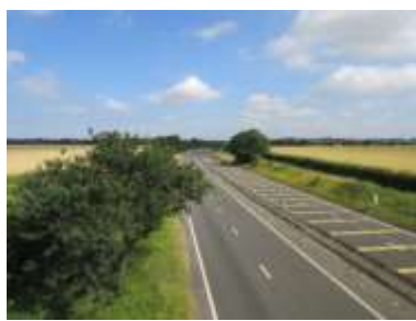
2. Cross over Sutton By-Pass