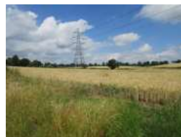
9. Fox Hollies Road on the horizon