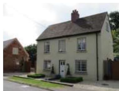
3. Forge Farm