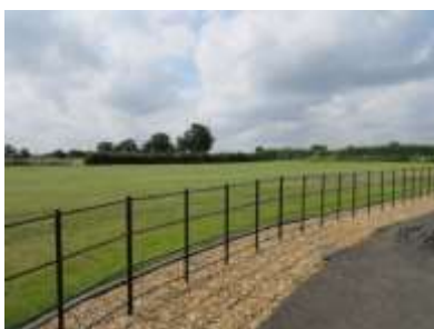
7. Ridge & Furrow Field at Peddimore