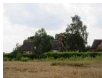
12. Ash Farm and Droveway