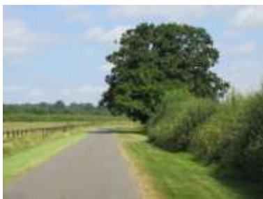
5. Road leading to Peddimore Hall