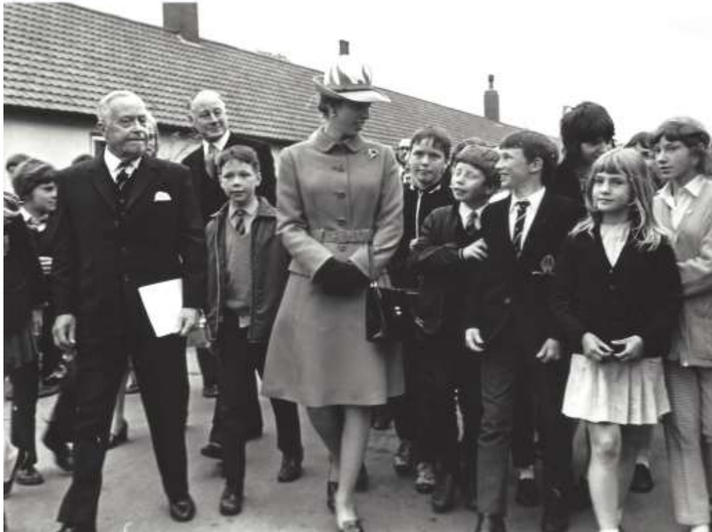
(3) HRH Princess Anne visit to Sutton to open Lingard House, 26 th May 1971