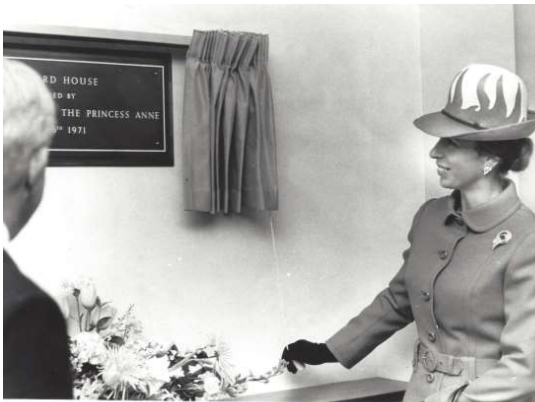
(4) HRH Princess Anne visit to Sutton to open Lingard House, 26 th May 1971