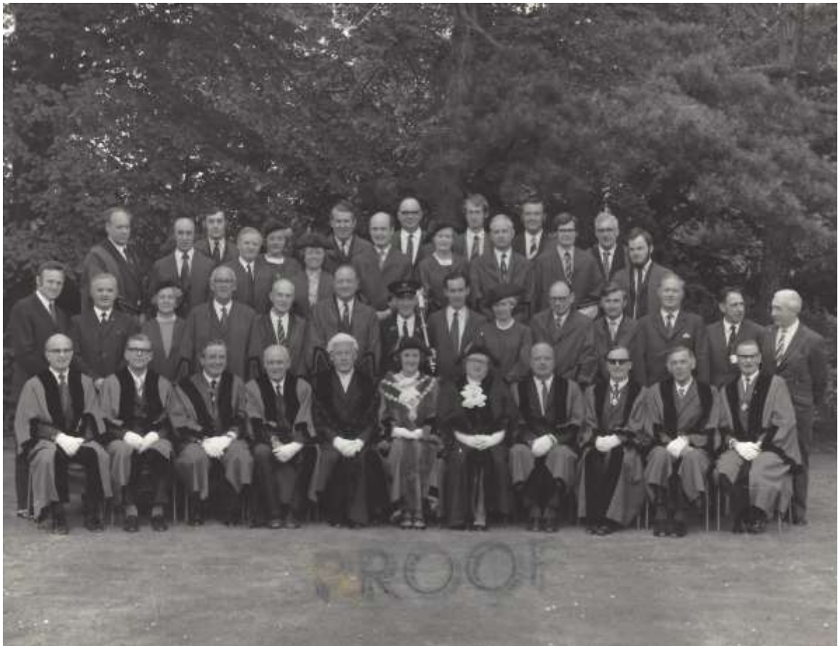
Town Council, 1972-73