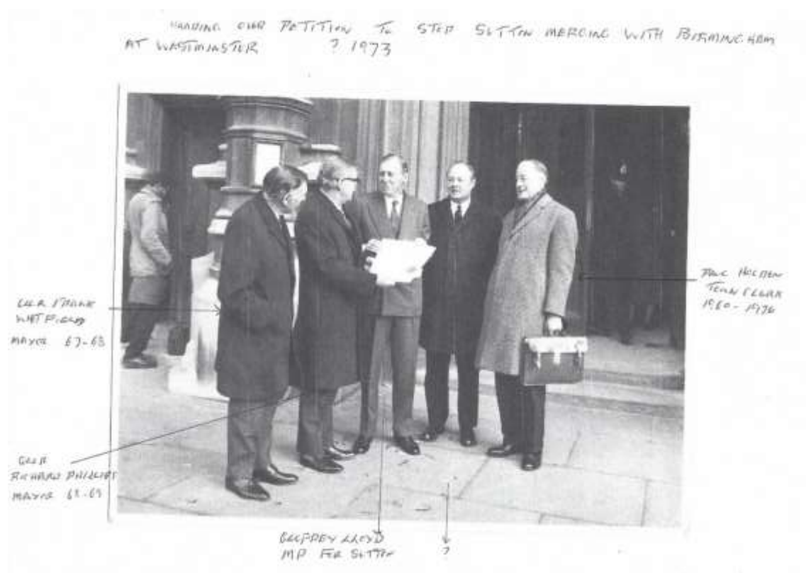
Photo handing over petition to 'save Sutton' outside Parliament