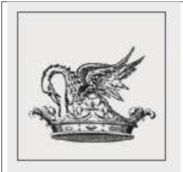
(b) Out Of A Ducal Coronet Or, A Demi-Pelican With Wings Endorsed Arg., Vulning Herself Ppr. (For Hartopp).

The boar suggests bravery and a willingness to fight to the death.