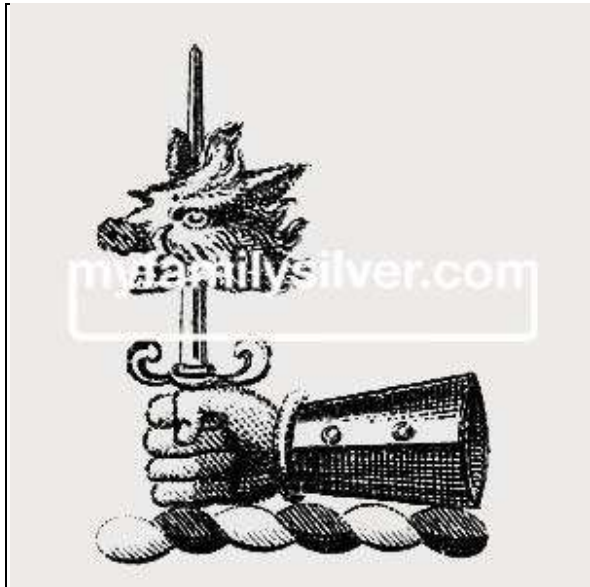
(a) An Arm In Armour Couped At The Elbow Lying Fesseways, The Hand Holding A Sword Erect Transfixed With A Boar's Head Couped, All Ppr. (For Cradock).

on it. Two symbols are explained, however, on the following website: https://www.myfamilysilver.com/pages/crestfinder.aspx which cites "Fairbairn's Book of Crests, 1905 ed" and gives the following detailed description of the Cradock-Hartopp crests :-