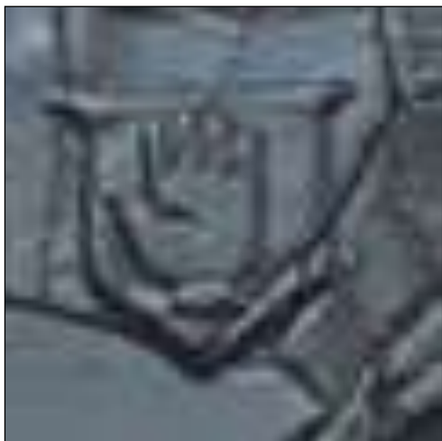
(c) A shield denotes knighthood, the hand faith.